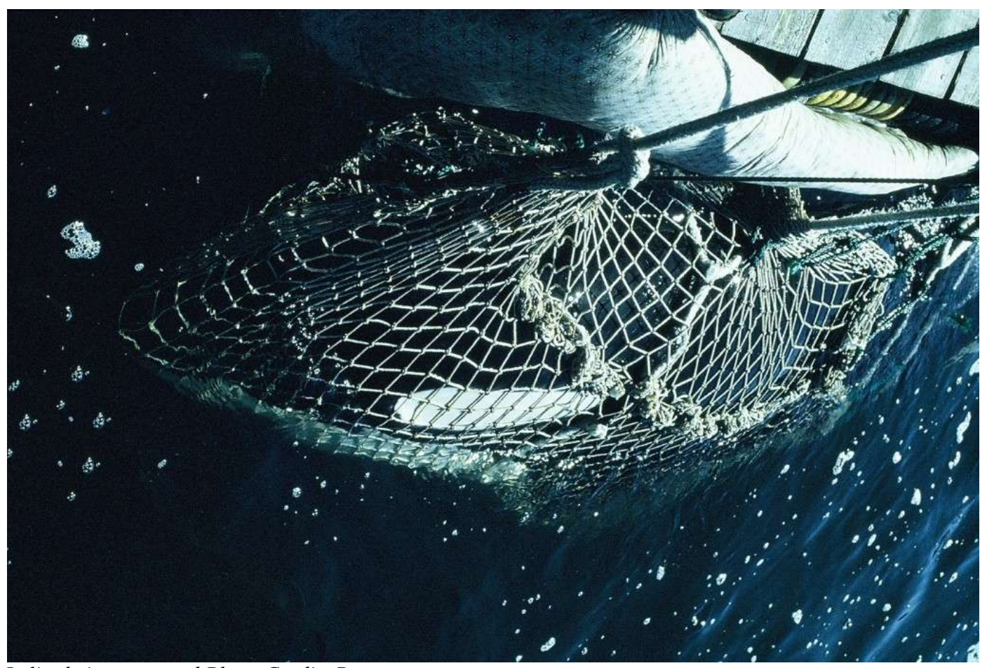
Lolita being captured

Wild caught orcas and dolphins living in captivity were violently captured and taken from their ocean habitat and families. They are trucked or flown to a sterile aquarium that bears no resemblance to their former ocean home. Captive orca and dolphins are not allowed to live in pods that resemble their natural pods in the wild. Wild orca and dolphin pods offer infinite opportunities for social interactions. In captivity, those opportunities do not exist; they are forced into artificially controlled groupings.