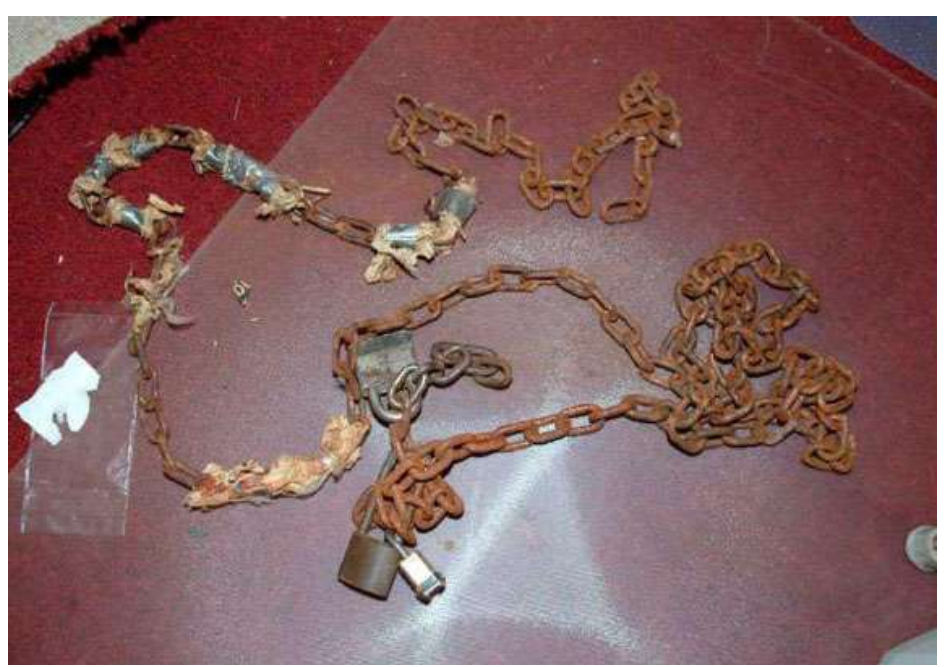
Chains found in Ariel Castro's House of Horrors